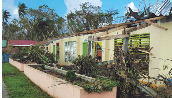
One of the many classrooms in Bicol damaged by Super Typhoon Nina in December 2016.

Super Typhoon Nina hit Bicol, Philippines on Christmas Day 2016. It affected over 1.7 million people, 90% of whom are in the Provinces of Albay and Camarines Sur. Educo estimates that 40% or over 600,000 of the affected population are children.