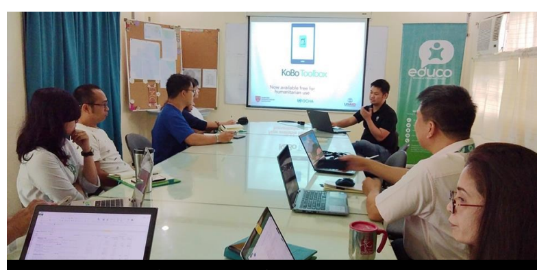
Learning session on Info Management for Humanitarian Response with UN OCHA Philippines on Feb 20