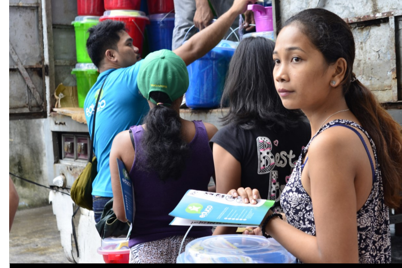
Relief distribution in Camalig on Feb 21