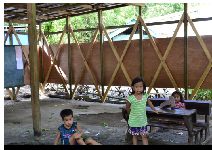
Children inside a newly constructed temporary learning space